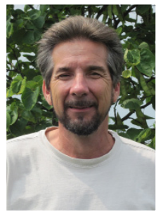
SAM Maintenance Supervisor After-Hours Emergencies (717) 532-3782