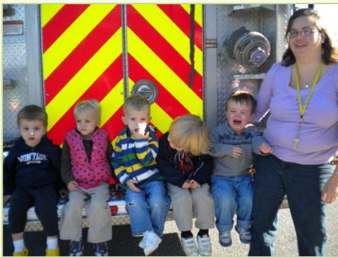
Sitting on the fire truck

We had a great October in Toddler B and look forward to more learning and fun coming up in November! Our fire safety unit came to life as we climbed inside fire trucks, held a fire hose and saw a firefighter all dressed up. We learned that fire fighters are our friends even though they look a little scary with their masks on.