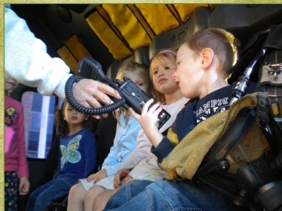
In the Fire truck